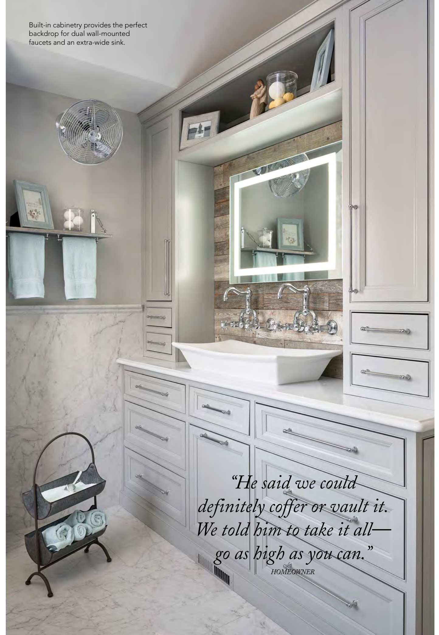
Built-in cabinetry provides the perfect backdrop for dual wall-mounted faucets and an extra-wide sink.

“He said we could definitely coffer or vault it. We told him to take it all—go as high as you can.”