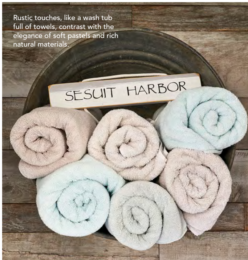
Rustic touches, like a wash tub full of towels, contrast with the elegance of soft pastels and rich natural materials.