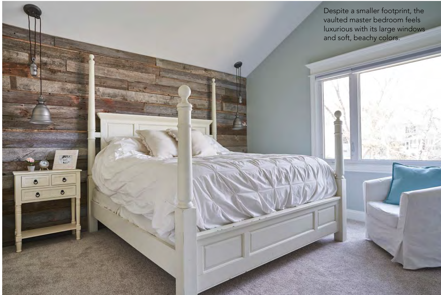
Despite a smaller footprint, the vaulted master bedroom feels luxurious with its large windows and soft, beachy colors.

The marble-look tile that Marske recommended for the bathroom floor and walls continues that luxurious look without the maintenance requirements of genuine marble. To soften the formal elements, the bathroom features such rustic accents as the washtub mounted above the toilet and the industrial-style fan on the wall.