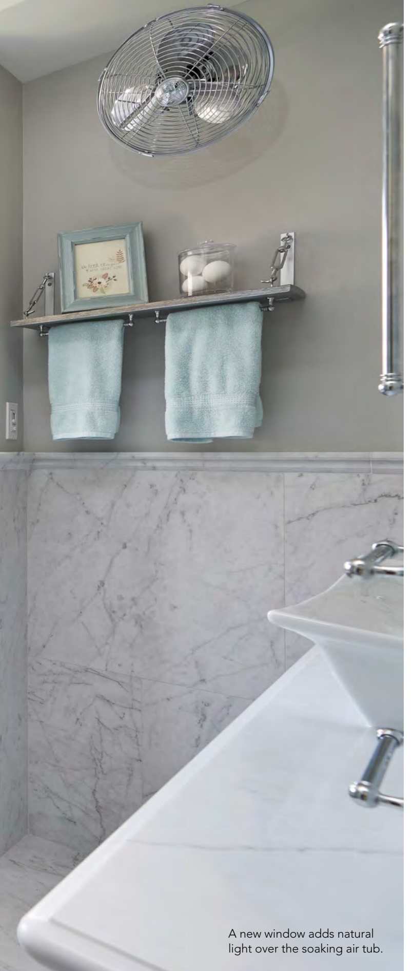
A new window adds natural light over the soaking air tub.