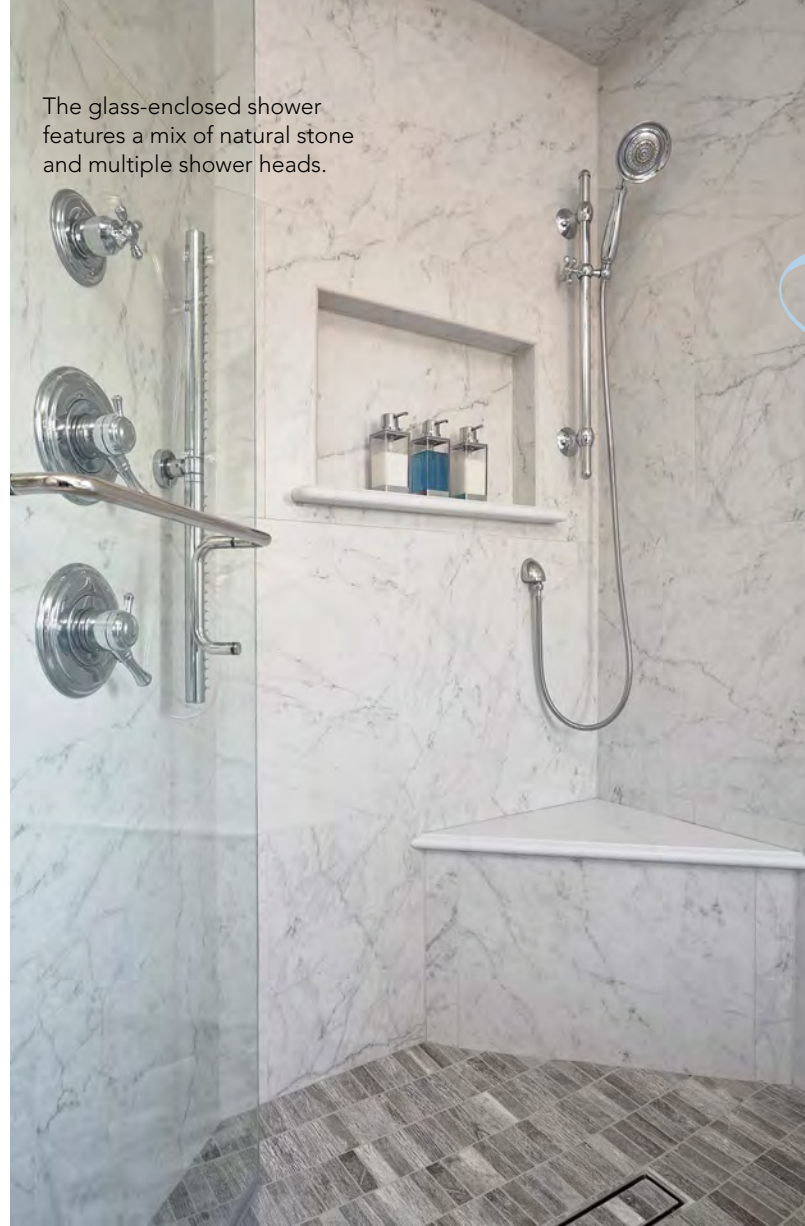
The glass-enclosed shower features a mix of natural stone and multiple shower heads.

The home stands out in the neighborhood. In an area full of homes clearly built around the turn of the latest century, this split-level has the look of a newer home. Barn-style garage doors with divided-pane windows, dark paint with white trim, and rustic front steps give the home an updated coastal-style exterior.